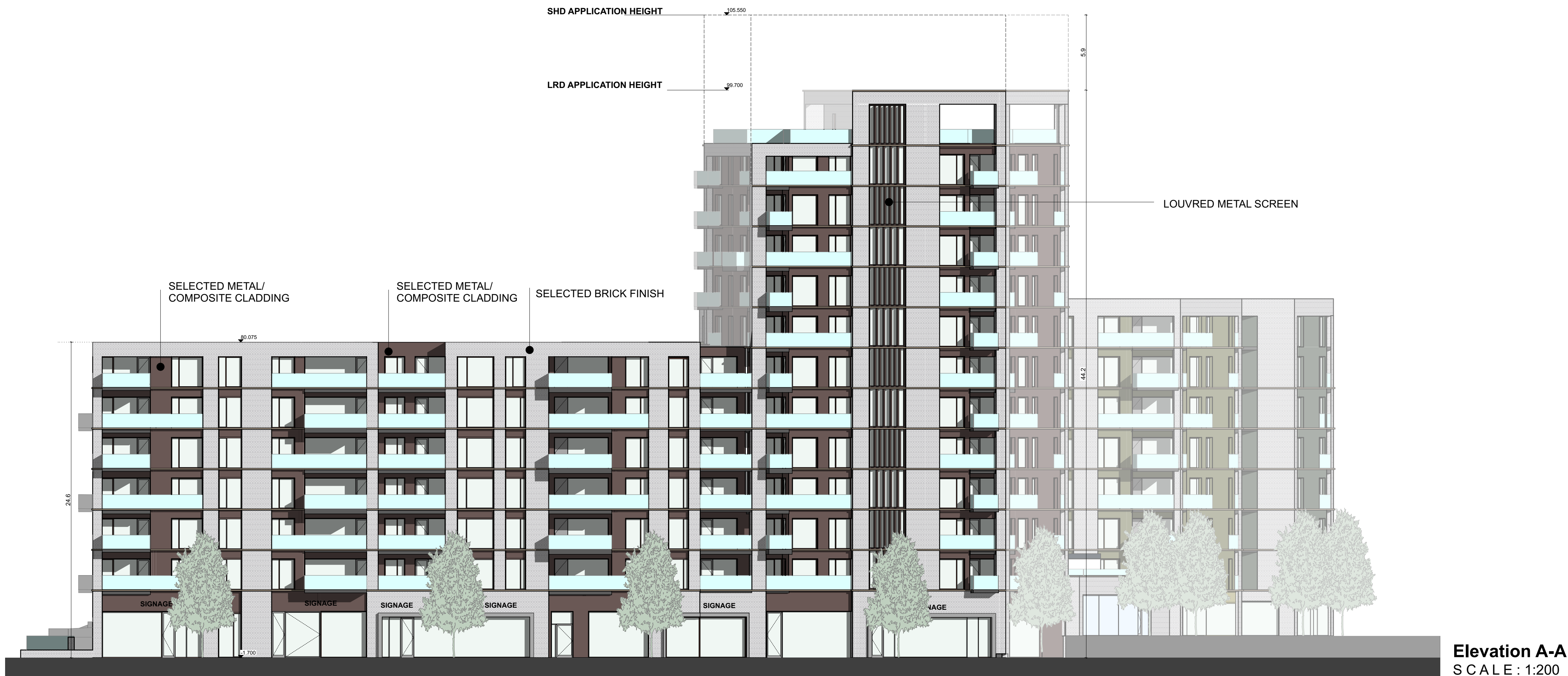
Elevation A-A SCALE : 1:200