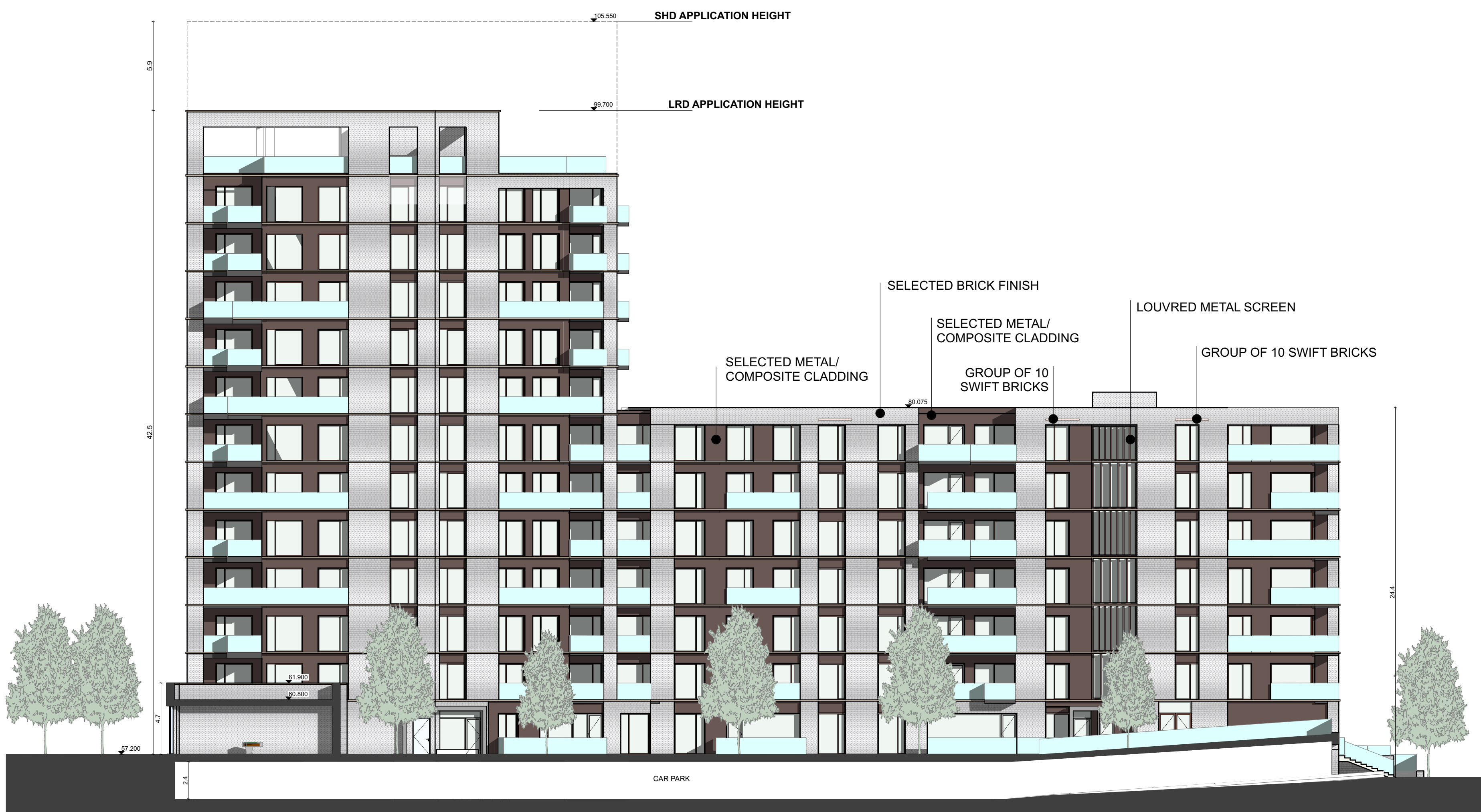
Elevation B-B SCALE : 1:200